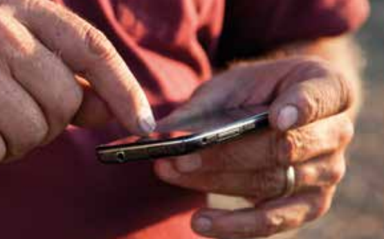
Adaptable to your needs