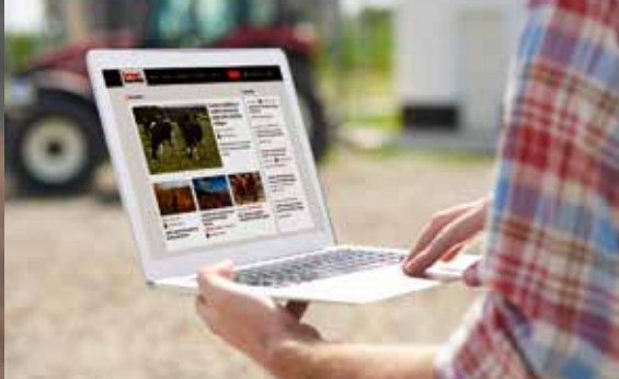
Improved site navigation