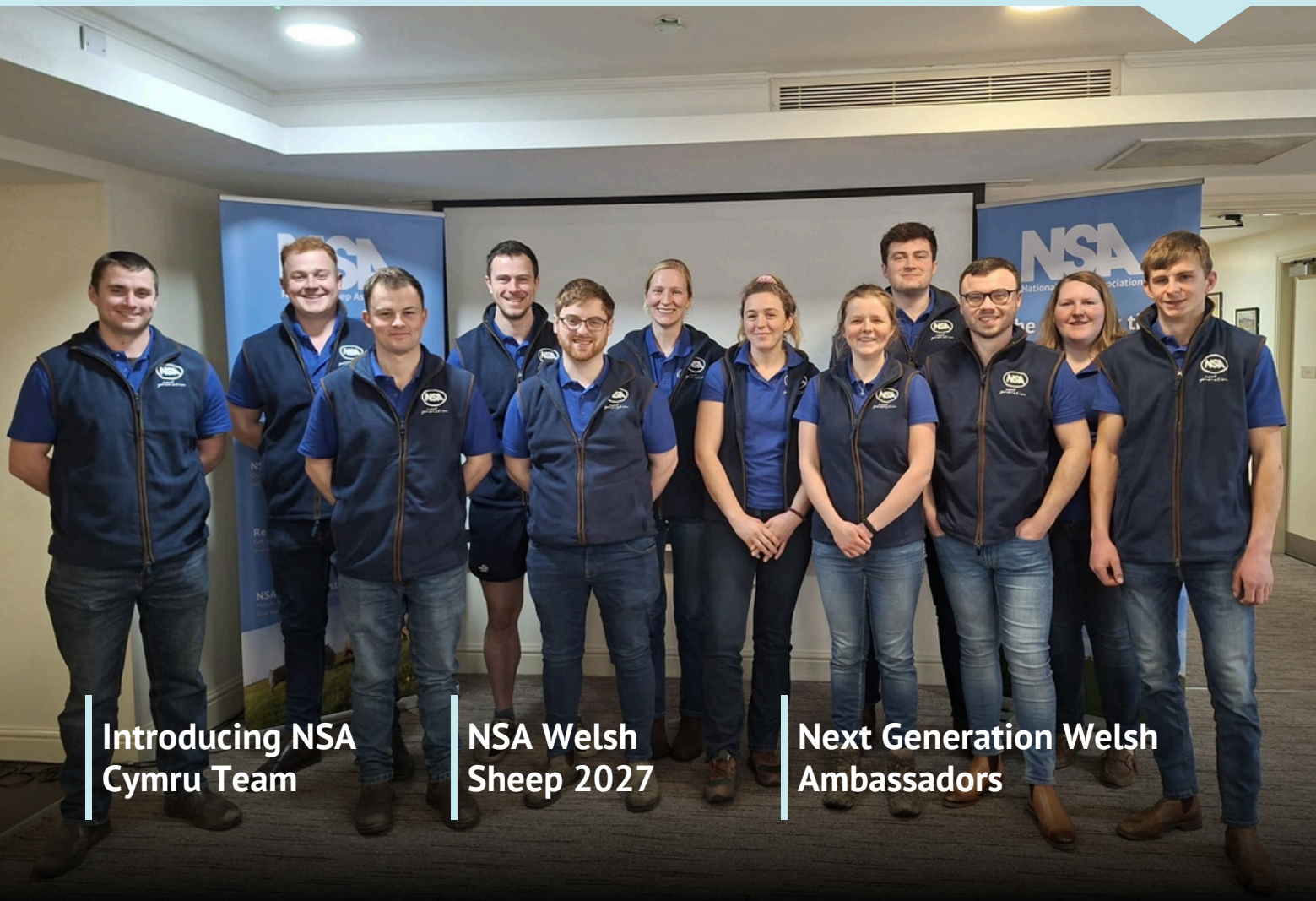
Introducing NSA Cymru Team

A NATIONAL SHEEP ASSOCIATION PUBLICATION