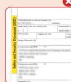
SAFETY AND SECURITY DOCUMENT