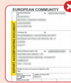
UK EXPORT DECLARATION