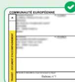
EU TRANSIT ACCOMPANYING DOCUMENT