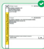
COMMON TRANSIT ACCOMPANYING DOCUMENT